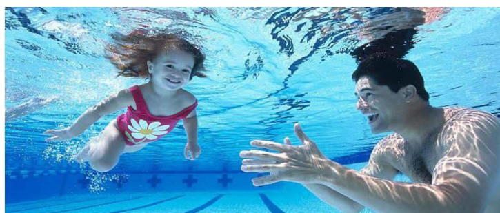
"open your eyes with ACP"